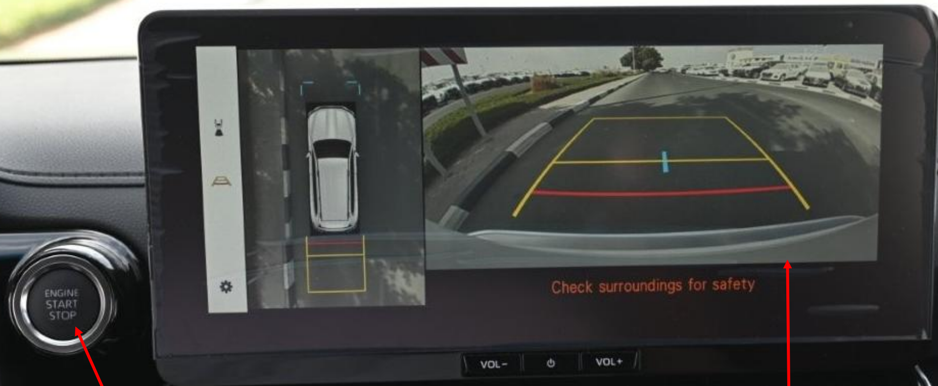
ENGINE START / STOP BUTTON