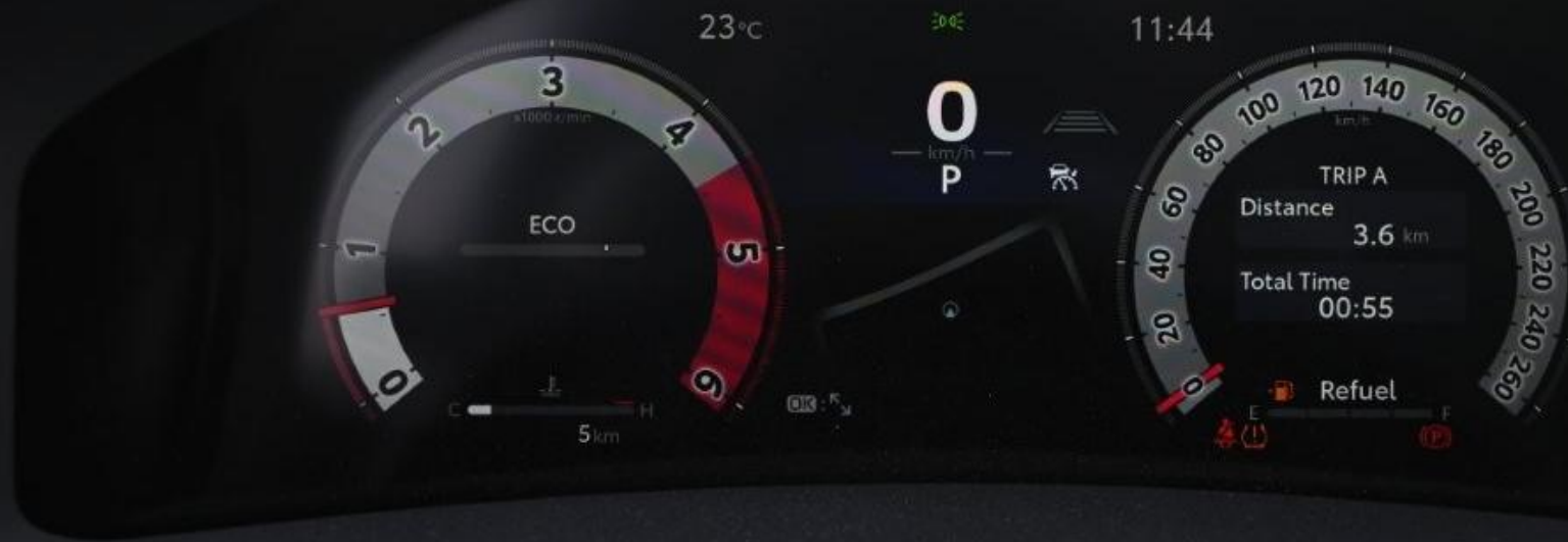
12.3" OPTITRON METER WITH MULTI-INFORMATION DISPLAY